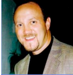
FILE - This undated handout photo released by the National Whistleblowers Center, shows former UBS employee Bradley Birkenfeld. Birkenfeld, the imprisoned ex-Swiss banker credited with exposing widespread tax evasion at Swiss bank UBS AG is seeking clemency from President Barack Obama, his attorneys said Wednesday, April 14, 2010.